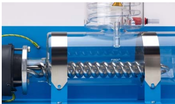
Heating element and boiler