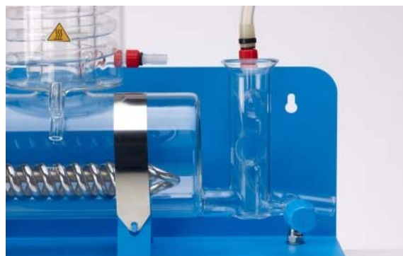
Outlet and constant level control