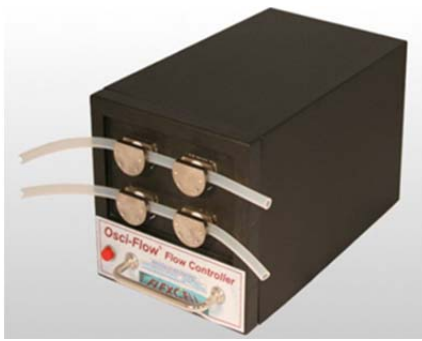
Figure 27. Osci-Flow<sup>®</sup> Controller