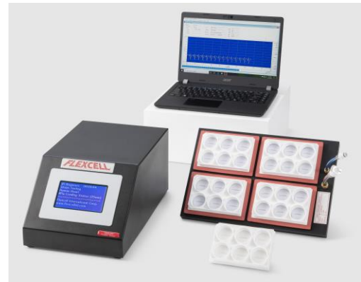
Figure 7. FX-6000™ Tissue Train® System