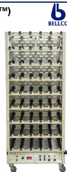
Base and 8 Decks, Sci/ERA™ unit