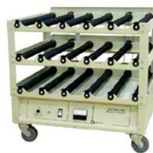
Base and 2 Decks, Standard unit