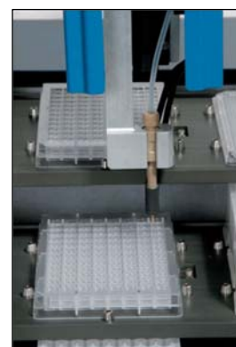
Single Channel Dispenser